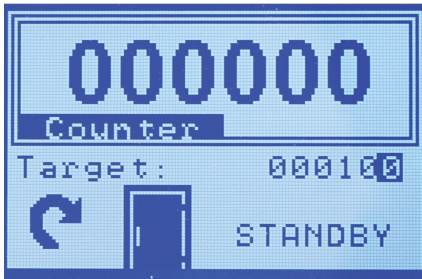
Los Angeles abrasion machine model 48-D0500/G - example of the graphic display screen