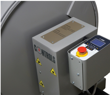
Los Angeles abrasion machine model 48-D0500/G - detail of the graphic display and membrane keyboard.